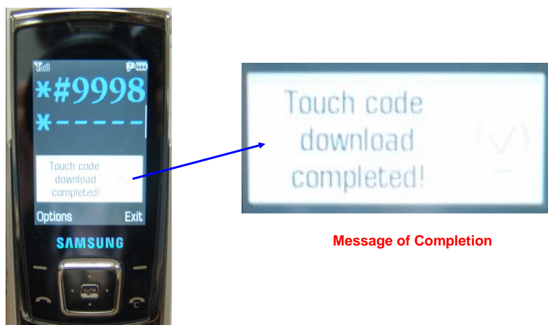
Message of Completion

4. Check the Touch Version be changed 1.0 into 2.0 after Inputting Key String *#0206*8376263#